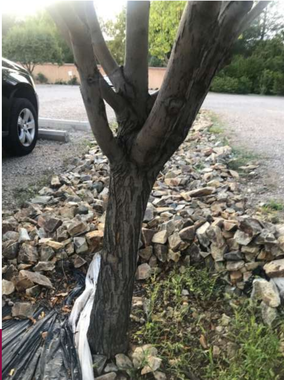
Northeast side of trunk