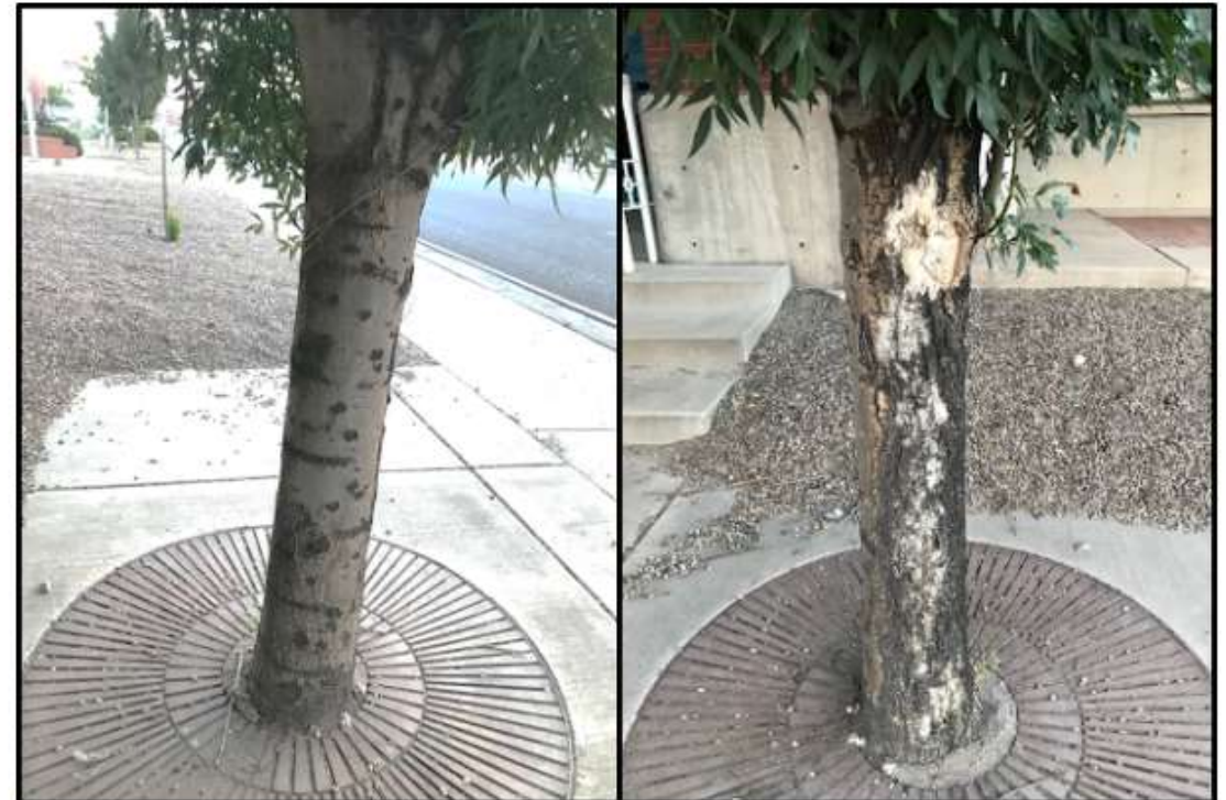
Besides being girdled and slowly killed by hardware at the base, this ash tree in Palen looks normal on the