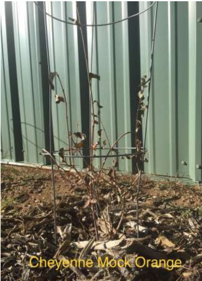
Cheyenne Mock Orange