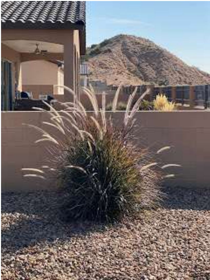
Purple fountain grass.